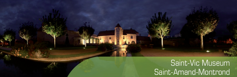
Saint-Vic Museum Saint-Amand-Montrond